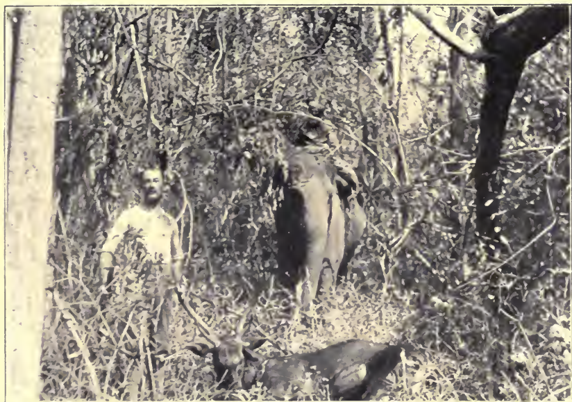
A SAMBHUR STAG AND MY ELEPHANT.